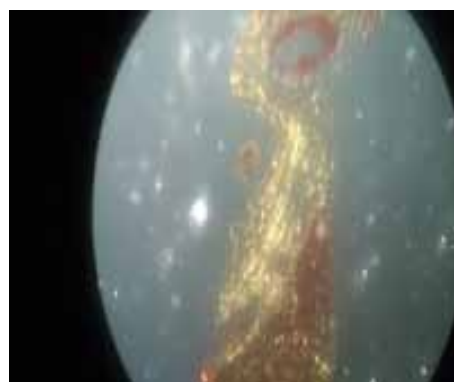
Fig. 4: Green birefringence confirming amyloid nature of deposits (polarized microscopy*400)

Bone marrow aspiration/biopsy was normal. In 2D Doppler echocardiography no systolic and diastolic dysfunction was found.