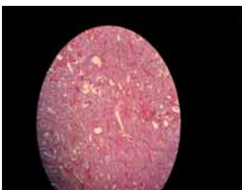
Fig. 6: Liver tissue distortion by extracellular deposition with no evidence of fibrotic reaction (Trichrome;*400).

\mu\text{mol/L} )(4). In 1971 Levy and colleagues during a review of literature reported that the prevalence of jaundice in AL amyloidosis was less than 5%(2), although our patient's chief complaint was jaundice. Ascites has also a prevalence of 10-20%(16,17). As our case had moderate ascites due to hepatic failure.