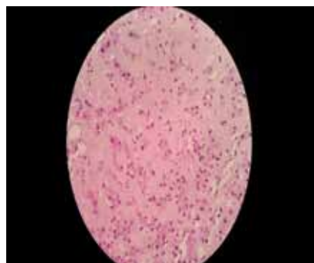
Fig. 2: Atrophy of hepatocyte plates by massive eosinophilic extracellular deposition along the sinusoid Disse space. (H&E;*400)