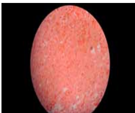
Fig. 3: Obviously amorphous deposits (amyloid) in hepatic sinusoids melting liver parenchyma (Congo red stain;*400)