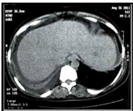
Fig. 1: Abdominal tomogram showing little fatty infiltration in the liver with ascites.