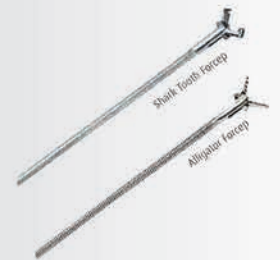
Shark Tooth Forceps