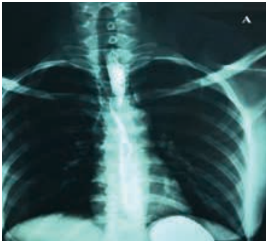
Fig.A: Barium swallow, anterior view.