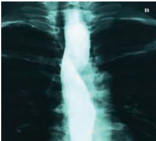
Fig.B: Barium swallow, anterior view.