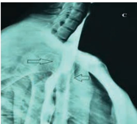
Fig.C: Barium swallow, lateral view.