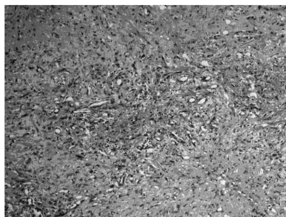
Figure 2. Hepatic hemangioendothelioma (H&E, ×100): Tumor shows a hyaline stroma, scattered cells and fine vascular lumina. Liver cells are totally lost in this area.